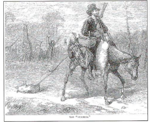
A bummer dragging a captured pig back to camp.

It is like some horrid nightmare. When I shut my eyes I see nothing but creatures and human beings in agony. The poor suffering horses! Some fortunately dead and out of their misery, others groaning in death pains, some with disabled limbs