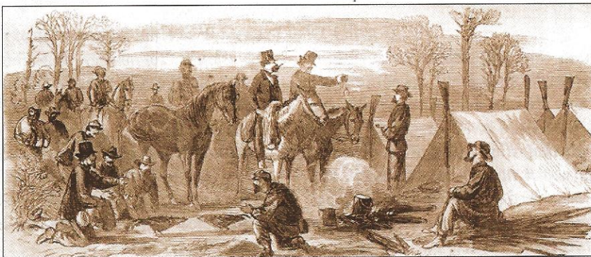
Bummers return to camp with their plunder.