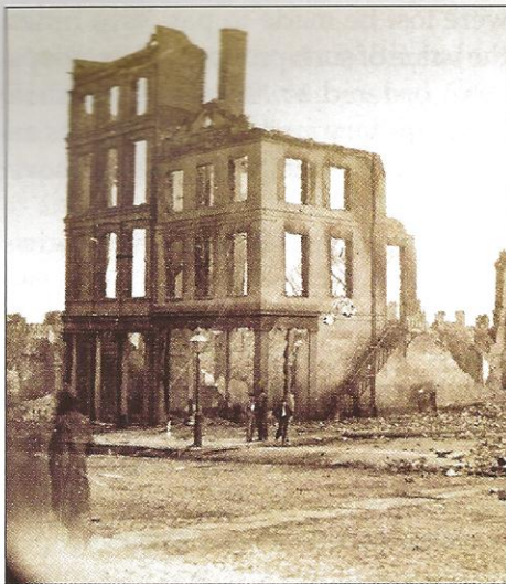
Ruins in Richmond, Virginia.

between two horses," recounted a friend who witnessed his death, "and dragged in plain sight of his agonized relatives to the open field of our town, where one man volunteered to do the killing, and ordered the helpless, dazed prisoner to stand up in front of him, while he emptied his pistol upon him." 35