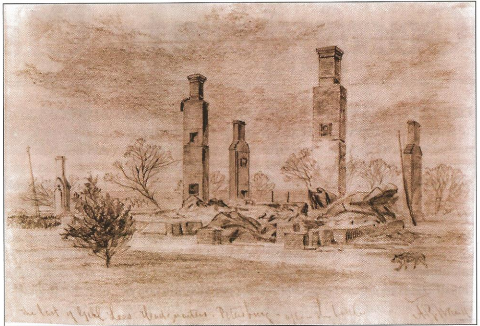
Ruins of the house General Robert E. Lee used as his headquarters near Petersburg.

Freed Blacks following the Federal army were stopped at Ebenezer Creek when troops were ordered to remove a pontoon bridge and leave thousands of the unwanted civilians on the other bank. Attempting to ford the creek, many panicked and drowned. Sherman defended his corps commander's actions, claiming he merely did not want to lose the pontoon bridge. In a letter to Washington on the matter, Sherman tried to dispel similar rumors "that I burned 500 n__s at one