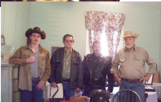
Maj. Josephus Somerville Irvine Camp No. 2031